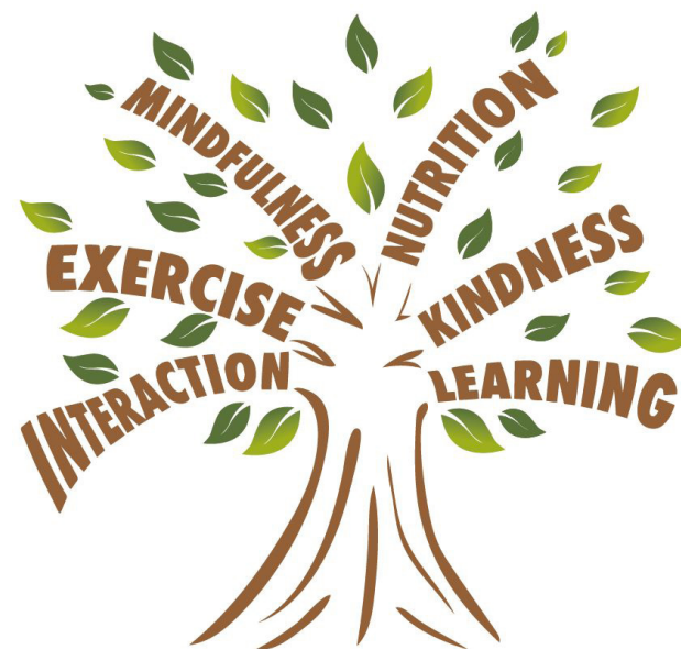
NEBOSH Wellbeing Tree

When you achieve the Working with Wellbeing qualification, you will be a huge asset to your employer. You will be able to make a real difference by applying the knowledge, understanding and skills gained from the qualification to help evaluate and improve levels of wellbeing in your workplace. Investing in good wellbeing at work not only helps us as individuals but can also provide many benefits for your organisation, such as, increased productivity, reduced staff turnover and less absenteeism.